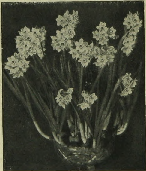
Chinese Sacred Lilies

The bulbs, of large size and great vitality, are of luxuriant growth, producing several spikes of flowers; the incredibly short time required to bring bulbs into bloom (six to eight weeks after planting) is one of the wonders of nature. "You can almost see them grow," succeeding almost everywhere and with everybody. They do well in pots of earth, but are more novel and beautiful grown in shallow bowls of water, with enough fancy pebbles to prevent them from toppling over when in bloom. A dozen bulbs started at intervals will give a succession of flowers throughout the winter. Large true China-grown bulbs. 8 cts. each, 20 cts. for 3, 70 cts. per doz.